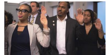
Figure 2. Commissioners at Sworn-in Ceremony